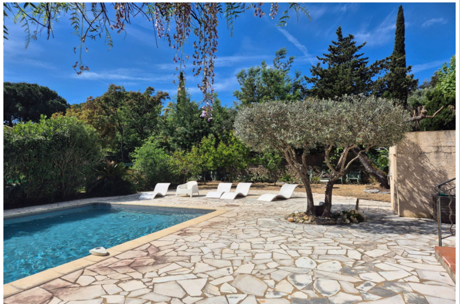
Villa Le Plan-de-la-Tour

Plan de la Tour. A short walk from the village, on a 1,400 m 2 plot, house of approximately 185 m 2 . It offers us an entrance opening onto the living room with fireplace, a fitted kitchen with its very bright dining area and terrace, 4 bedrooms, 1 bathroom with showers and 2 shower rooms, all with cupboard and dressing room, 1 very pretty independent 2-room apartment with its living room and fitted kitchen area, 1 bedroom, 1 shower room. Outside, beautiful terrace around the 10x4.50 swimming pool, dining area and outdoor lounge.